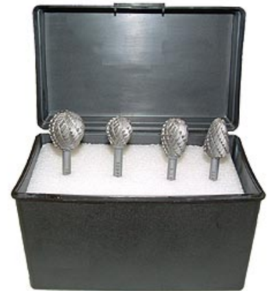
SETS ALSO AVAILABLE